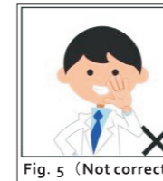
Fig. 5 (Not correct)