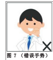
图 7 (错误手势)

6、音乐录像 点按 图标进入音乐库选择背景音乐，并点按使用，返回控制界面，录制视频中即有背景音乐。