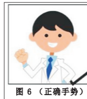
图 6 (正确手势)