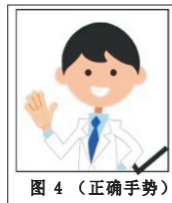
图 4 (正确手势)