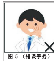
图 5 (错误手势)