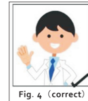
Fig. 4 (correct)

(* No palm detection during video recording)